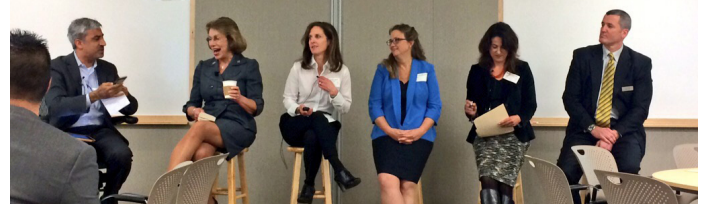
The panel at Eden Housing's Housing & Education Policy Breakfast

NPH member Eden Housing, our subregional partner Housing Trust Silicon Valley and Microsoft hosted a Housing & Education Policy Breakfast in May.