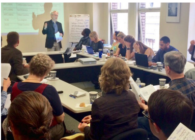
Packed room for the NPH AHSC Developer Debrief