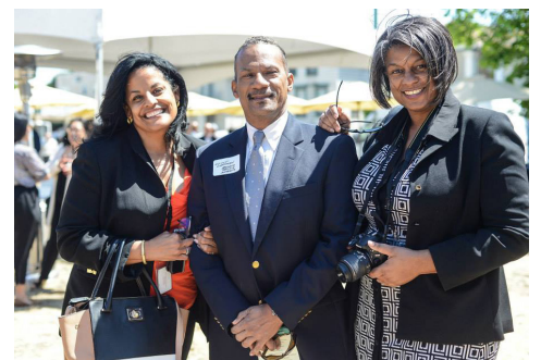
EBALDC breaks ground at 11th and Jackson