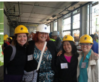
NPH & EBHO staff during Affordable Housing Week