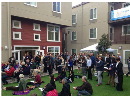
SAHA's Grand Opening of Arboleda