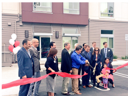
Eden Housing & Roem open Studio 819 in Mountain View