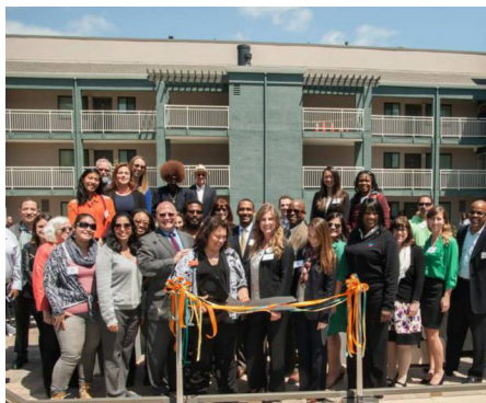
BRIDGE Housing + Services at Richmond Center Grand Opening

Below are a few of our favorite photos courtesy of EBHO and HTSV!