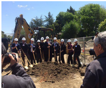
Adobe Services and MidPen Housing's Laguna Commons Groundbreaking