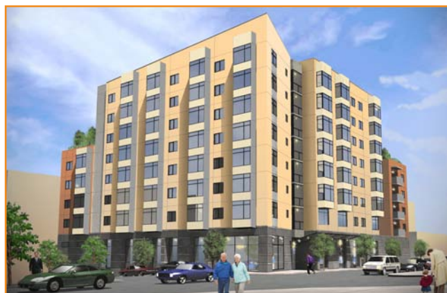
Artist rendering of Mary Helen Rogers Senior Community

broken ground on two affordable housing projects totaling $70 million and 175 units. The $30 million Veterans Commons on Otis Street, a joint venture with Swords To Plowshares, will transform a surplus city-owned building into affordable rental housing for 76 homeless senior veterans. The $40 million Mary Helen Rogers Senior Community, at Golden Gate Avenue and Franklin Street, is a ground-up development on a 16,500-square-foot surface parking lot. The project is being developed in partnership with UrbanCore.